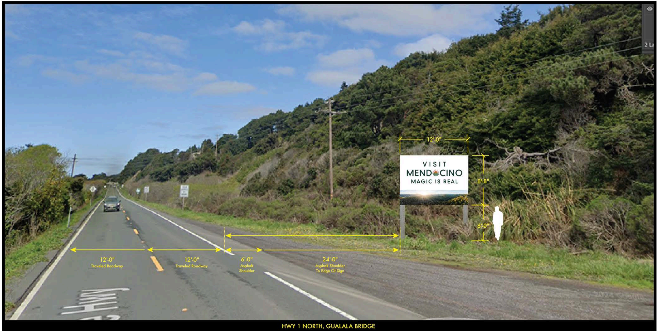
HWY 1 NORTH, GUALALA BRIDGE