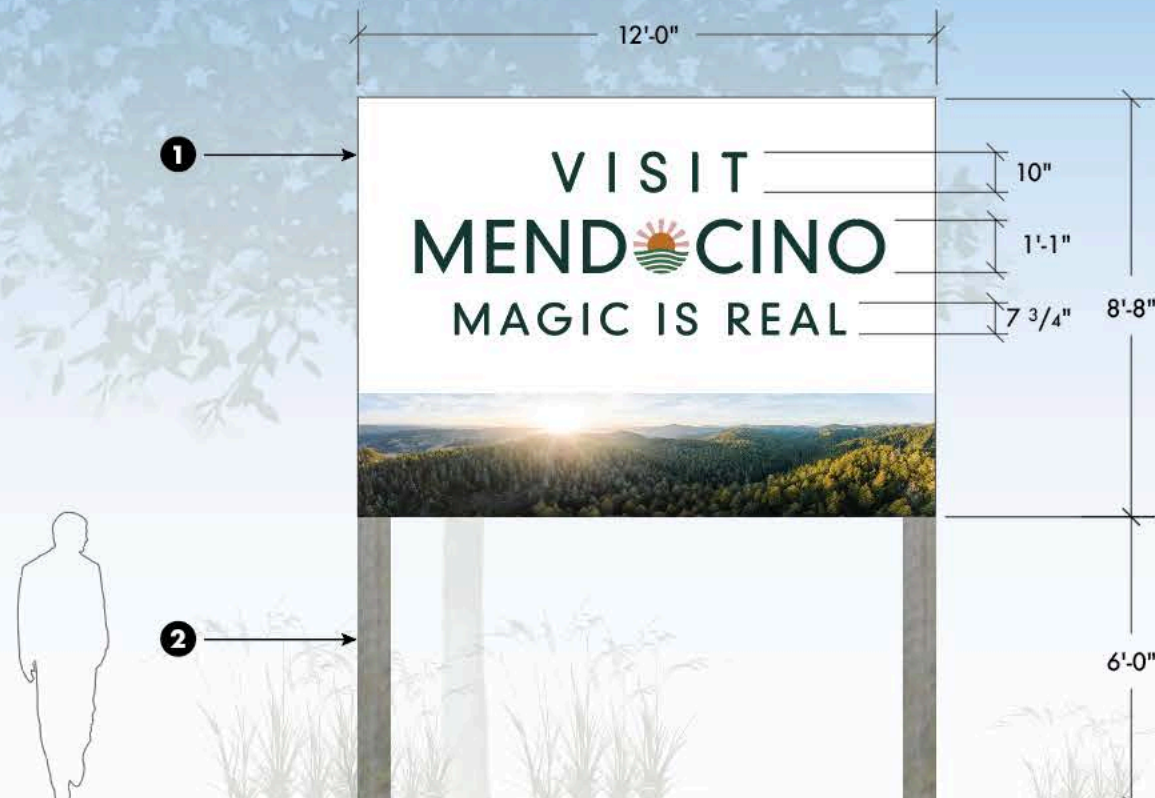
FRONT VIEW - HWY 1 NORTH, GUALALA BRIDGE

NOTE: Dashed lines indicate seams in face after printing to 4'x8' .080 aluminum.