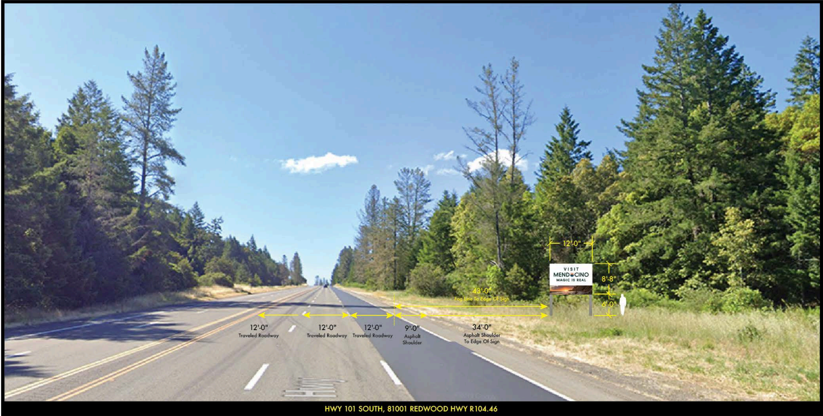
HWY 101 SOUTH, 81001 REDWOOD HWY R104.46