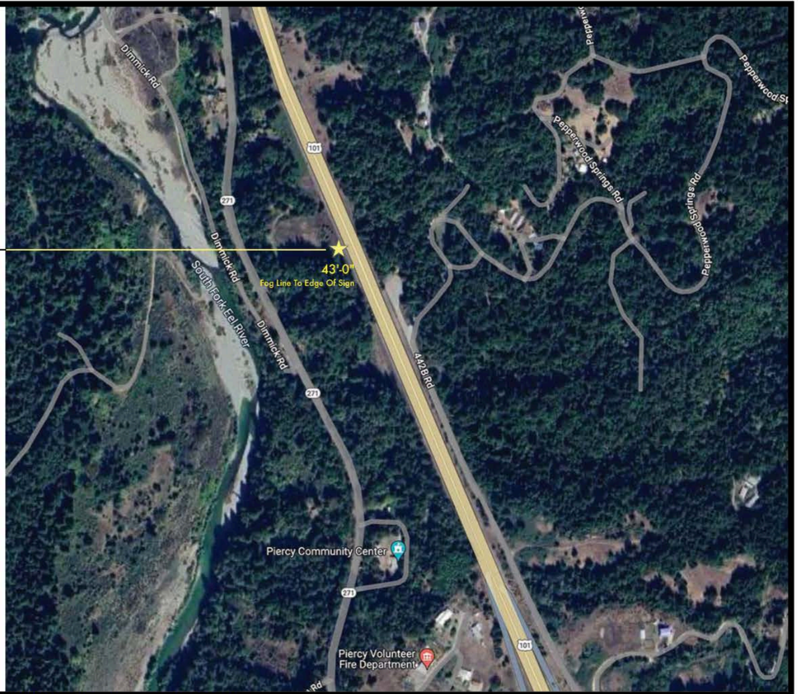
HWY 101 SOUTH, 81001 REDWOOD HWY R104.46